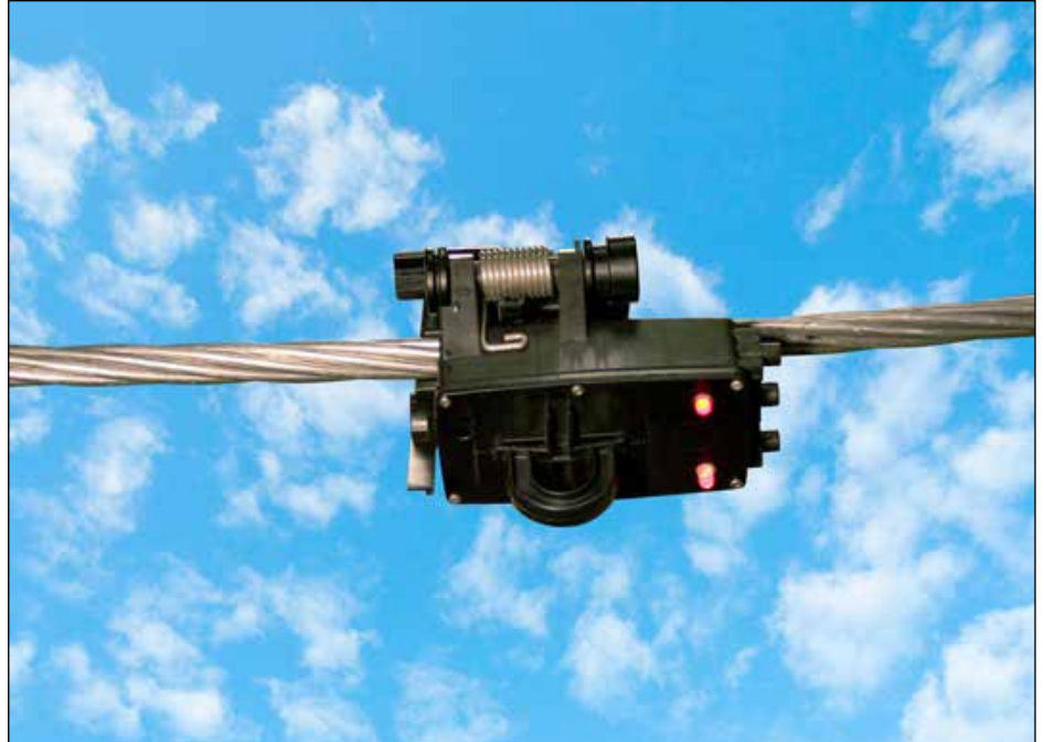
Figure 1. S.T.A.R. Programmable Delayed Reset (SDOH) faulted circuit indicator.

SDOH FCIs consist of a sensor unit with an integral dual LED indicator powered by a Lithium Ion battery. Rugged solid-state construction ensures dependability and accuracy. Installation can be achieved on a wide range of cable diameters with a single hot stick. The sensor unit itself features a clamping mechanism design that allows easy snap-on connection to the live conductor with the use of a single hotstick.